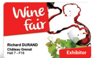
Invitations to your events